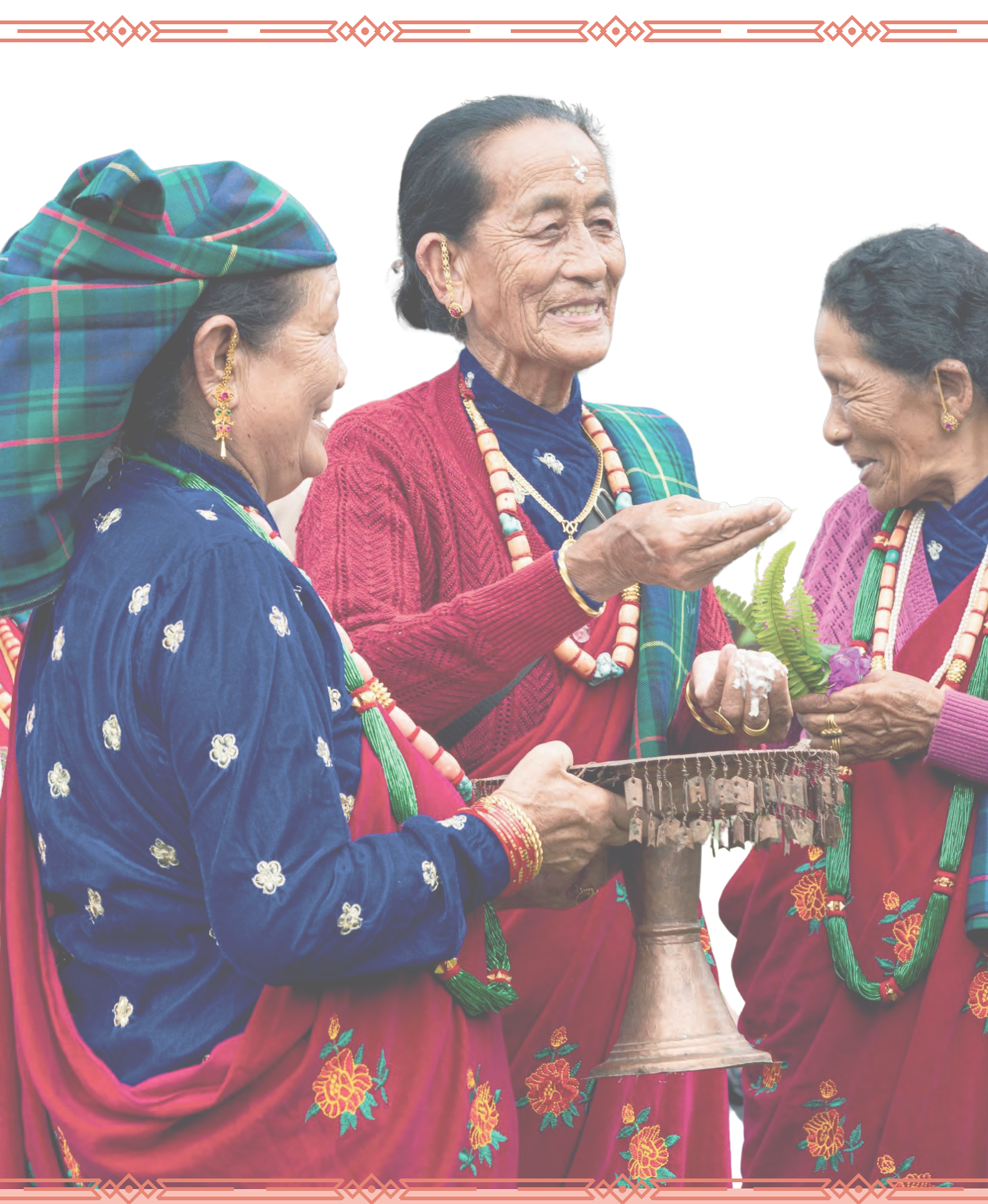
Image: The mothers' group of the Gurung Indigenous Peoples of Tohmle village bids farewell to the conference participants with a traditional ritual of putting tika (rice) on their foreheads.

For more information on the Tohmle statement, please contact: