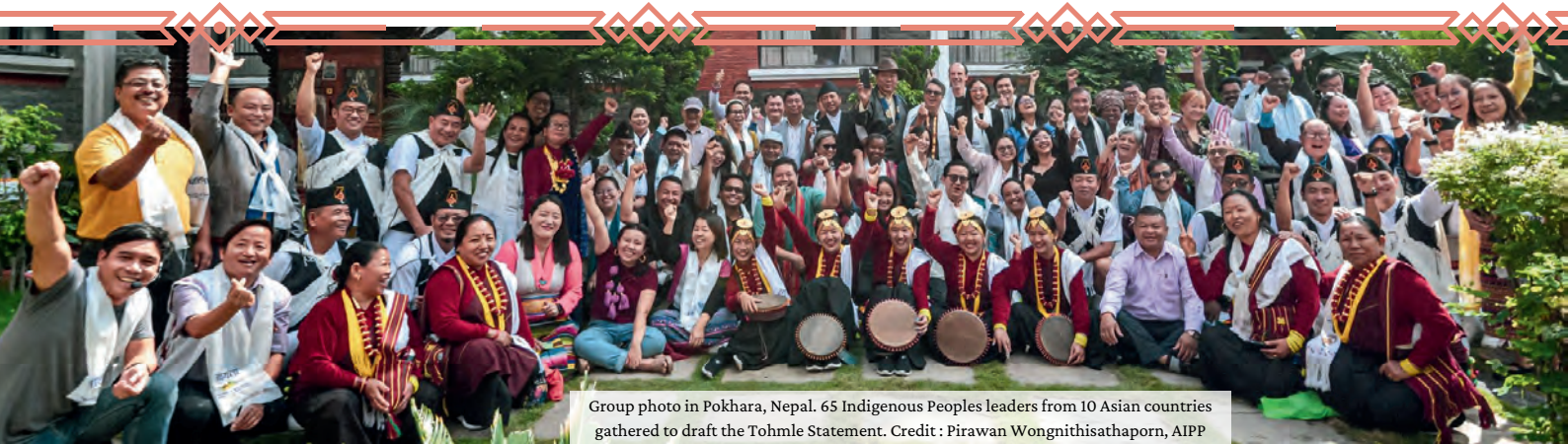
Group photo in Pokhara, Nepal. 65 Indigenous Peoples leaders from 10 Asian countries gathered to draft the Tohmlle Statement.

This statement was developed at the 4th Indigenous Knowledge and Peoples of Asia (IKPA) Conference on Indigenous Peoples' Rights, Biodiversity, and Climate Change, held on October 1-4, 2024, in Pokhara, Nepal