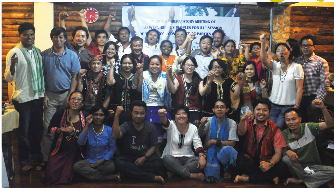
Participants of the regional preparatory meeting of Asia Indigenous Peoples in Chiang Mai, Thailand