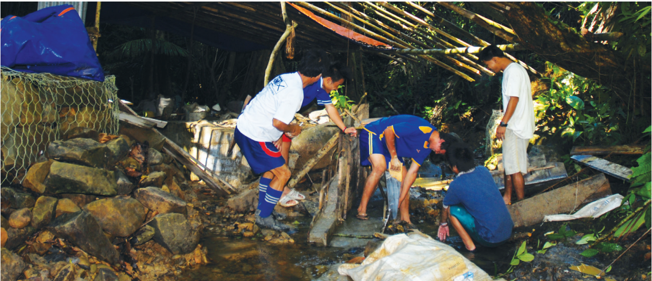
Indigenous villagers in Kampung Buayan, located deep in the Crocker Range in Sabah, working together to build a micro-hydro. Indigenous Peoples in Malaysia have been advancing local climate resilience, piloting pico and micro-hydro projects across the country to bring electricity to remote areas while successfully protecting watershed areas

indigenous territories. For instance, Indigenous peoples living in mountainous provinces do not cut trees at the mountain top area when practicing shifting cultivation in order to combat erosion during cultivation and to maintain soil moisture even during prolonged drought.