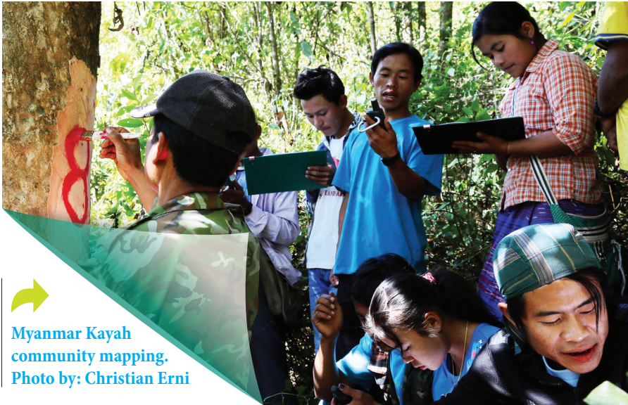
Myanmar Kayah community mapping.

to the customary land tenure rights of ethnic nationalities and land-use mapping. The document also mentions Free, Prior, Informed Consent (FPIC) as a means of addressing “land monopolization and speculation” (IWGIA.2017: 376). It establishes a process for recognition of the rights of indigenous communities and not just individuals.